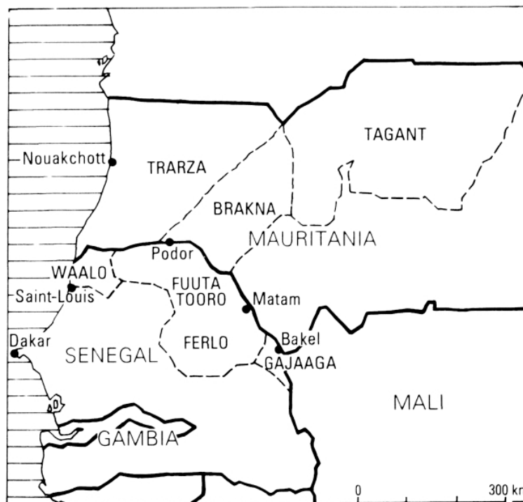
MAP 2. Pre-Eighteenth Century Ethnic Polities in the Senegal River Valley.

manuring of farmers' fields and the exchange of dairy products for grain and fish would assure the reproductive survival of herding, farming, and fishing communities. Thus, the river frontier during precolonial history presented a high degree of temporal and spatial permeability and flux of populations. Relations among the neighboring Maure and black African populations became characterized by mutual but contradictory associations of complementarity and conflict ( ibid. : 559).